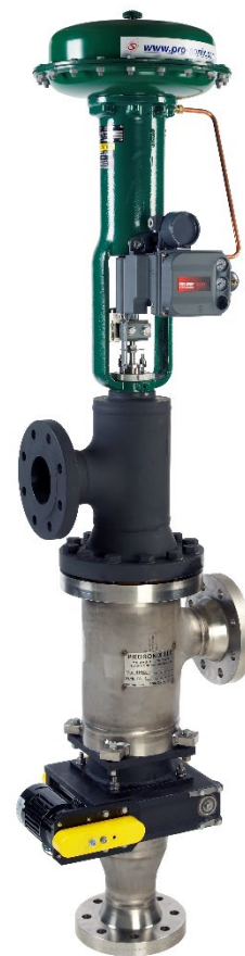
Figure 2 PSX Jet cooker with OptiShear