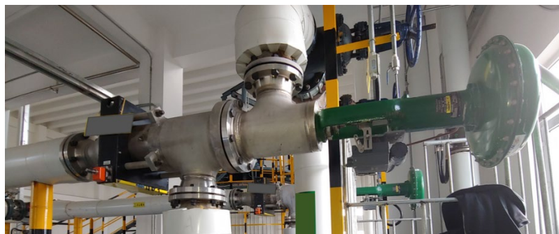
Figure 1 Prosonix Coaxial Jet cooker installation

The ProSonix Jet Cooker is specifically designed for Jet cooking starch slurries for ethanol, sweeteners and alcohol production. ProSonix™ unique method of direct steam injection utilizes high velocity steam and an engineered starch path to completely and thoroughly cook the starch to meet customer requirements.